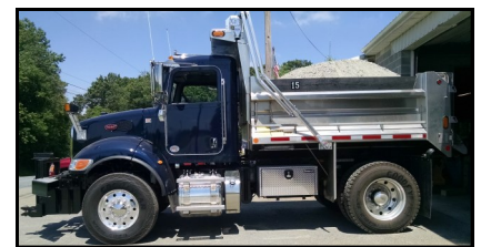
2015 Peterbilt Single Axle Dump Truck