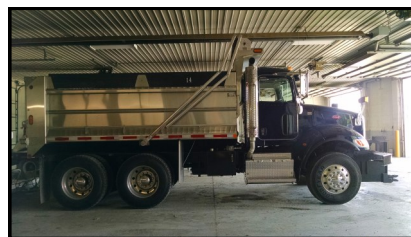
2014 Peterbilt Tandem Dump Truck

In January 2014 our new tandem Peterbilt dump truck was delivered and our new Peterbilt single axle dump truck was delivered in February 2015. In May we purchased a used trailer to haul pipe, boxes and equipment to job sites.